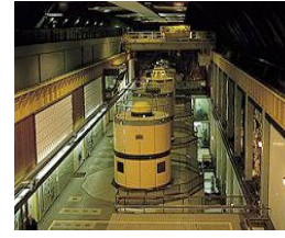
Cruachan Power Station