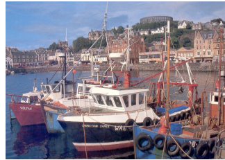
Oban—Gateway to the Isles