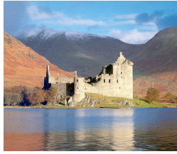
Kilchurn Castle, Lochawe